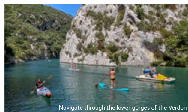
Navigate through the lower gorges of the Verdon