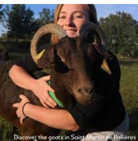
Discover the goats in Saint-Martin de Pallières